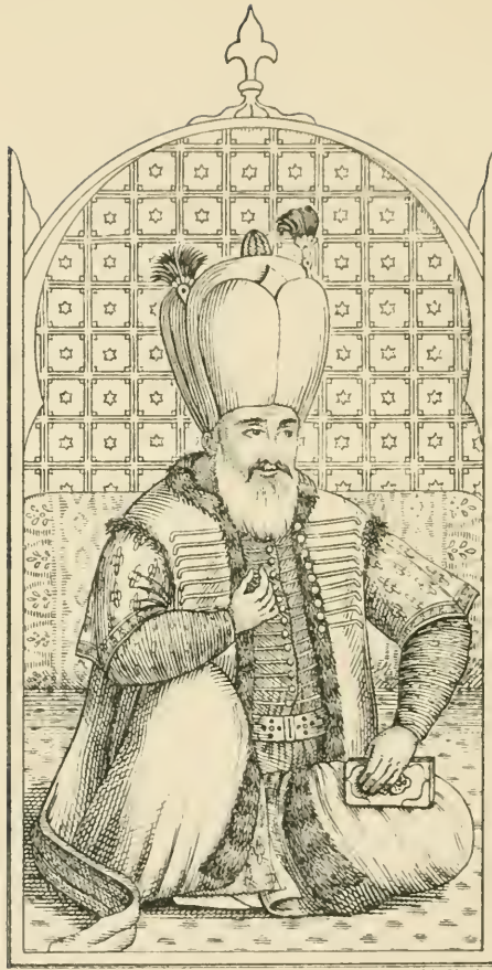
MUHIBBİ SULTAN SULEYMÂN I.